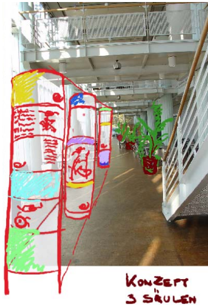
Karsten Winkels, bauwerkstatt

In connection with the design modules, Allplan Freehand brings your individual mark back to technical CAD data. You have infinite ways of enhancing your Allplan CAD data with real freehand sketches. With Allplan Freehand, you can either use these as background documents and sketch over them or draw directly on the Allplan document. You can naturally also merge the background document and freehand sketch at a later point in time. You can also edit Allplan data on a bitmap basis. You have a number of tools available for this, e.g. activating and processing bitmaps. You simply use the cutter, paint pot or wand – or merely change the RGB and transparency values. Various pen types also let you sketch your ideas and presentation drawings quickly and effectively with wide range of display options.